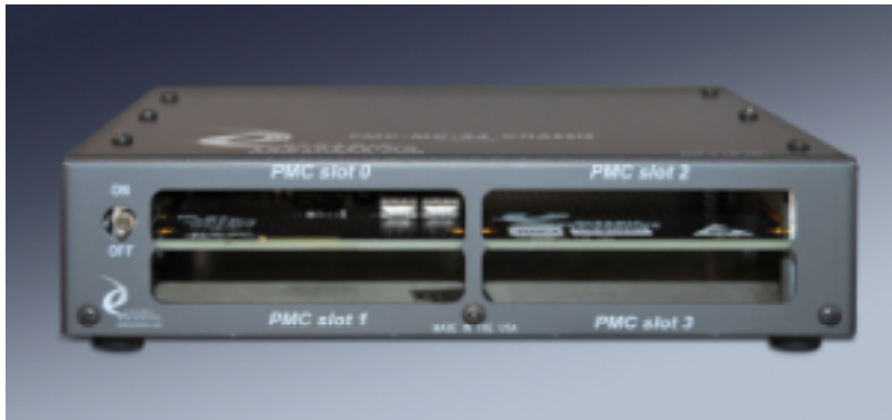
PMC-MC-X4 carrier mounted in X4 chassis.

A complete solution based on the Mini Carriers can be provided with the PMC-MC-X2 or PMC-MC-X4 chassis. The Dynamic Data Sheet for the chassis is located at http://www.dyneng.com/pmc_mc_x2x4_chassis.html